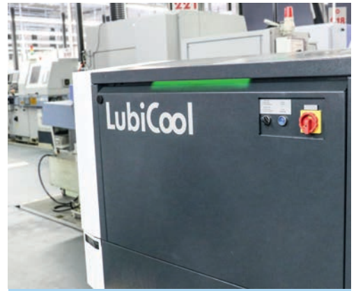
KNOLL Maschinenbau has packed all of its extensive expertise regarding the high-pressure cooling lubricant supply of automatic lathes into the mobile LubiCool® unit.

chips and bring the cooling lubricant to the cutting edge." He therefore had some of his automatic lathes fitted with a permanently installed combination of chip conveyors, filtration systems and high-pressure pumps from KNOLL Maschinenbau. Paul appreciates the partnership with the company, which is based in Bad Saulgau and is regarded as a leading supplier of conveyor systems, filtration systems and metalworking pumps: "KNOLL is a very reliable partner who has been precisely adapting every one of our chip conveyors to the respective machine or factory environment for years. With the filters and pumps mounted, KNOLL ensures that the cooling lubricant is always available with a high degree of purity and with optimum pressure." The production employees are also enthusiastic about KNOLL products' simple handling and low maintenance requirements. The products' long-term quality and high availability are particularly appreciated and are of great importance because many machines run in continuous operation.